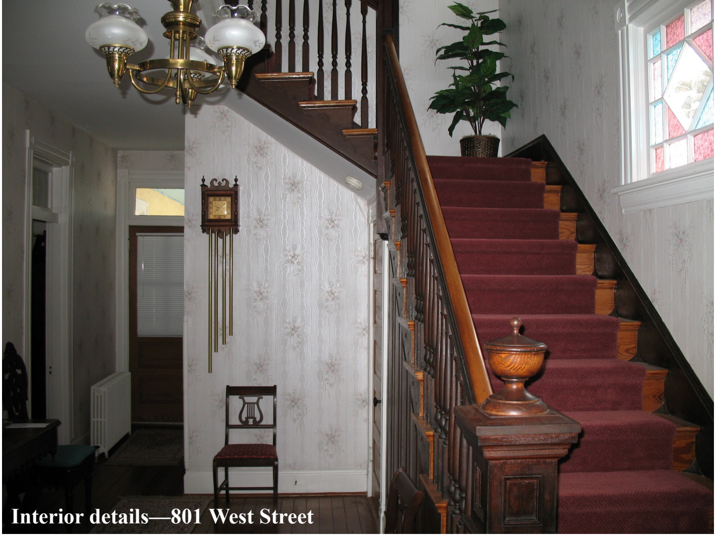
Interior details—801 West Street