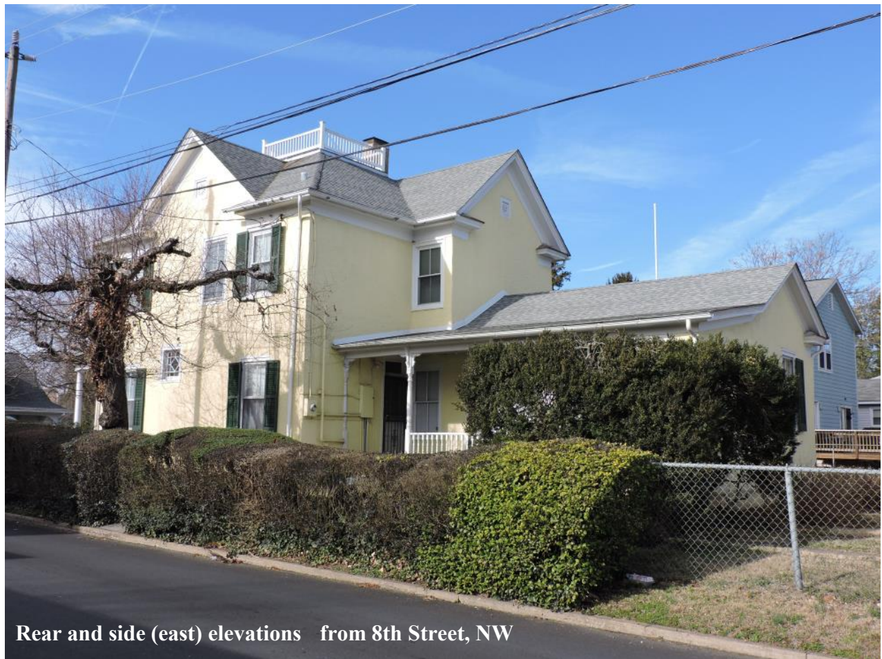
Rear and side (east) elevations from 8th Street, NW