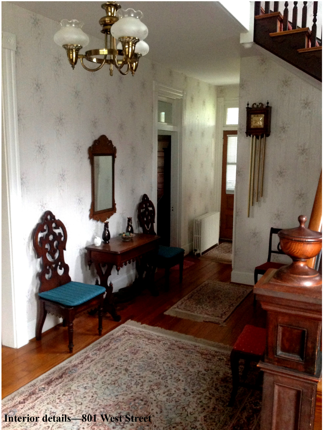
Interior details—801 West Street